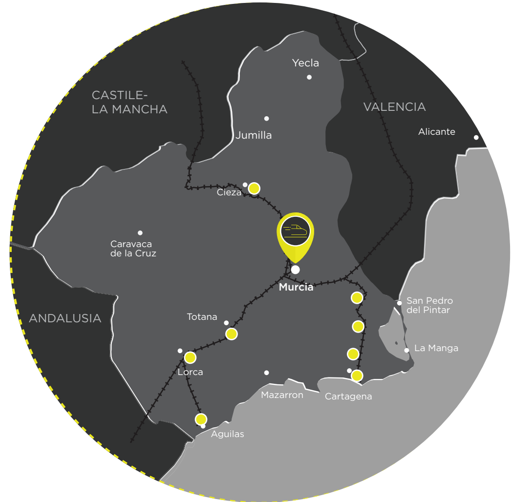
Map of Train Locations

New trains and the High Voltage electrification of the Great Western Mainline reduce train journey times and increase comfort and business opportunities.